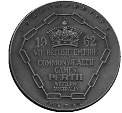
1962 Perth Medal